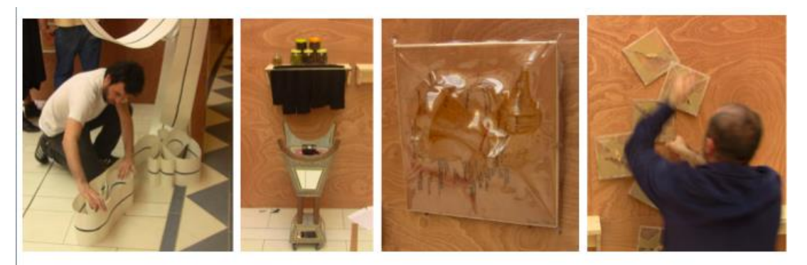
Figure 1. Installing the Souvenirs of the senses exhibition in the Saffron Gallery

to the 'hybrid souvenir'. The group very consciously conducted group tasks, both reconnaissance journeys aimed at gathering materials, sensations and interactions and writing group tasks where the experiences were run through reflective and productive aspects of writing short descriptions through which we connected the dots across multiple systems of reference. From our collaborative exercises and engagements each individual focused on a particular sensation-experience-material-location nexus on which to base their workshop souvenir to be exhibited with all the other workshops from the conference.