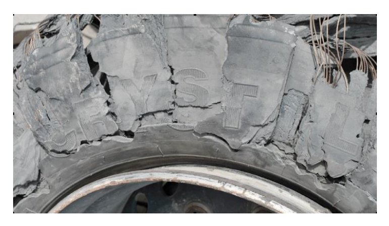
Foraging for sensations and instances of material writing (photo P West)