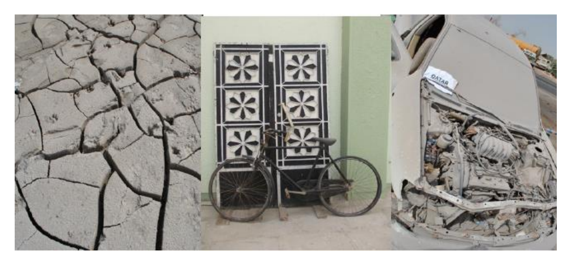
Preliminary investigations for site-writing, Doha

Site-writing is a way of discussing the site-specific and site-conditioned aspects of 'languaging' a place or being promoted by language. Place-making churns the affects that emerge from situated interaction, recognizing the embeddedness of living systems. The making of place is an affective process that experiments with the boundaries of the body-environment divide. Writing from a site, and becoming attuned to a site's specificity, requires coordination of thought, feeling and interaction that rides the confluence of a site's concurrent specificities.