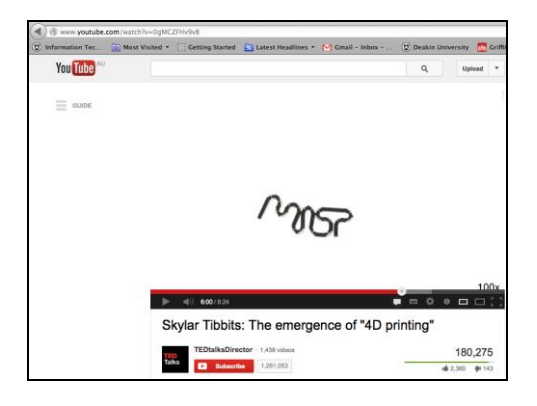
Tibbits: The emergence of 4D printing - end of a sequence that represents the transformation of the 4D printed living cells into a pre-programmed structure.)

It is curious the first structure to take shape as a function of 4D printing and self assembly ends up as a shape, or more accurately the word, that the video demonstration of programmable materials ends up forming the letters: 'MIT'. This self-promotion is not only an exercise in branding and product placement on the new frontier of intellectual property development, it also demonstrates how quickly the frontier is colonised by the old habits of thought. Even on the 4D plane, which acts as a nano-horizon of material writing, the concept can be given priority. As with any form of writing, one must be vigilant not to be co-opted and bend living cells to the will of the corporate program.